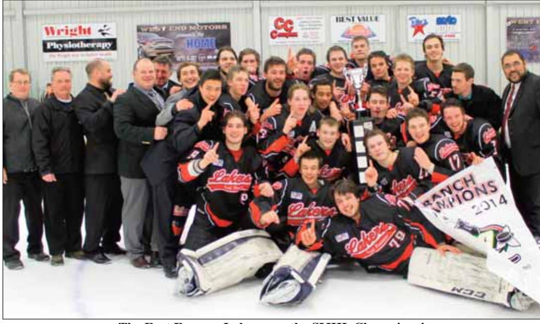
The Fort Frances Lakers are the SIJHL Champions!