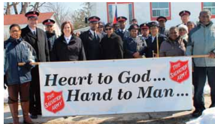
The procession ended at the Salvation Army where lunch was served.