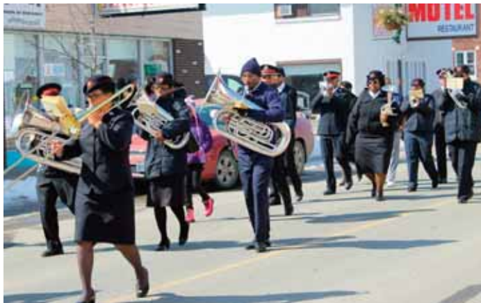
And the band played on...