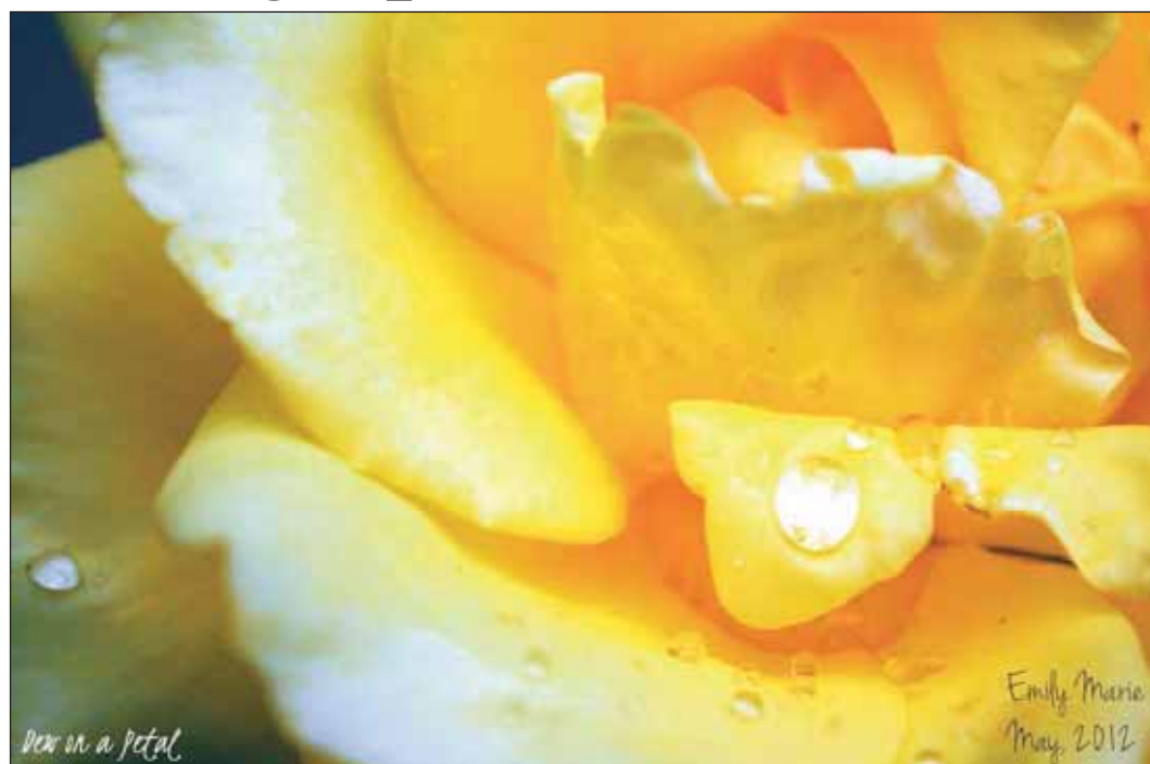
A little hint of what's coming soon, Dew on a Petal!