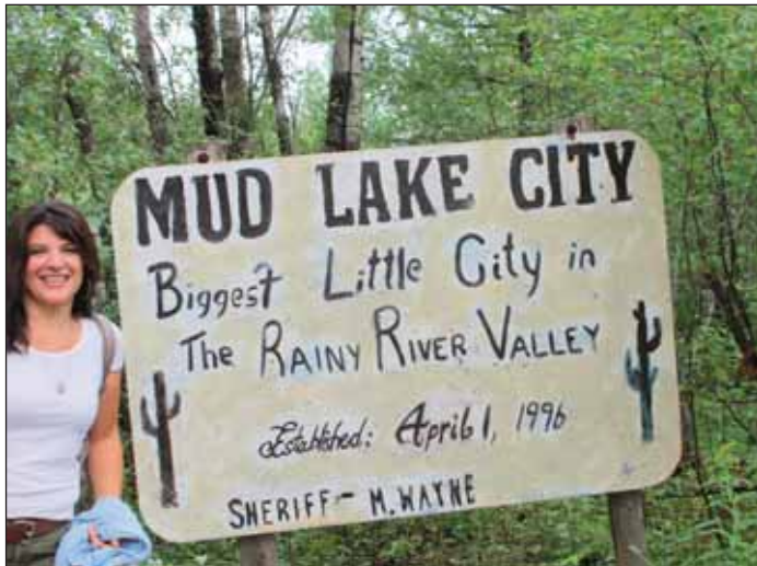
Welcome to Mud Lake City!