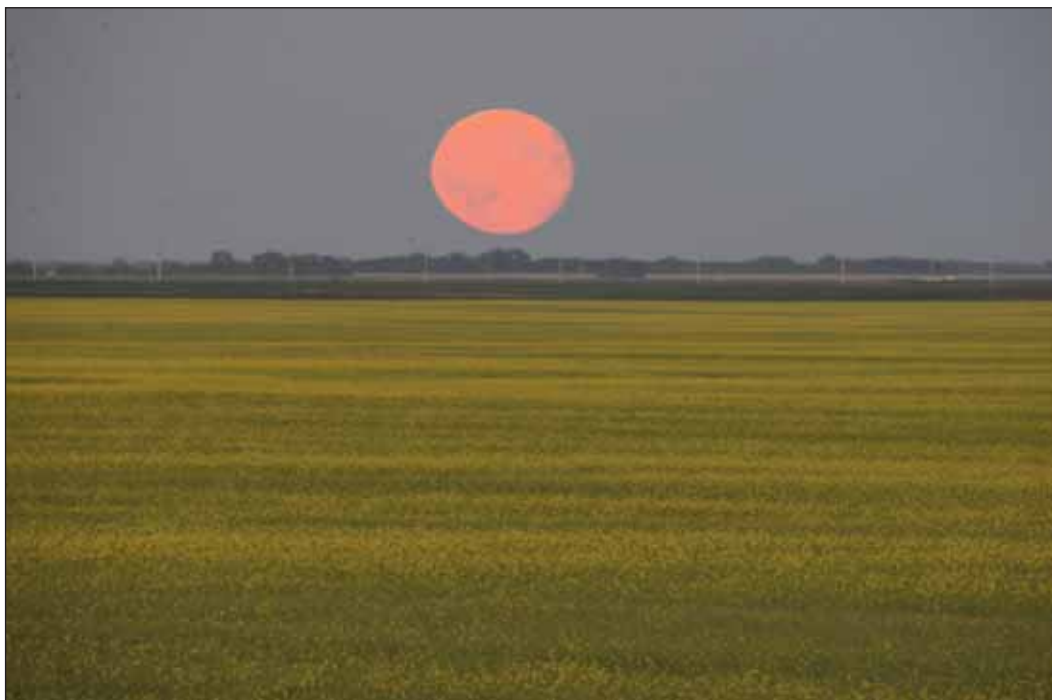
This picture was taken just south of Winnipeg on Provincial Road 200 at the canola field I like to photograph at various times of the year. I took this one last night (August 11, 2014), featuring the Super Moon, using a 600mm telephoto lens that makes it look almost unreal.