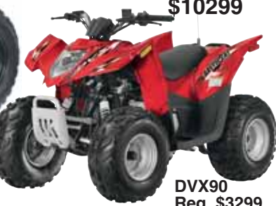
DVX90 Reg. $3299 $2699

Be ready for Snow! Book your snowplow now and get Last Year's Price