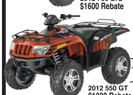
2012 550 GT $1300 Rebate

2014 Models 550-1000 2 Year Warranty or FREE Snow Plow