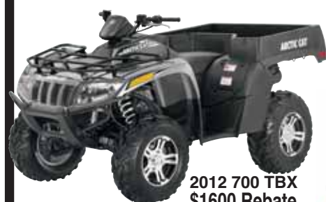
2012 700 TBX $1600 Rebate