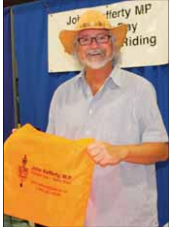
John Rafferty, Member of Parliament was at the Exhibition Hall.