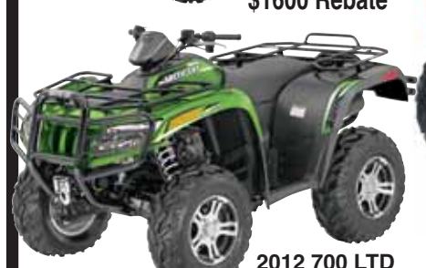
2012 700 LTD $1600 Rebate