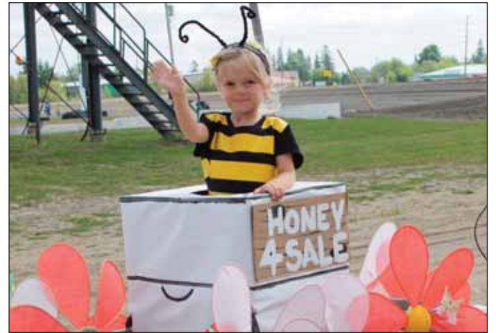
Who wouldn't buy honey from this busy little bee?