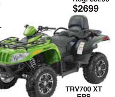
TRV700 XT EPS

2014 Models 550-1000 2 Year Warranty or FREE Snow Plow