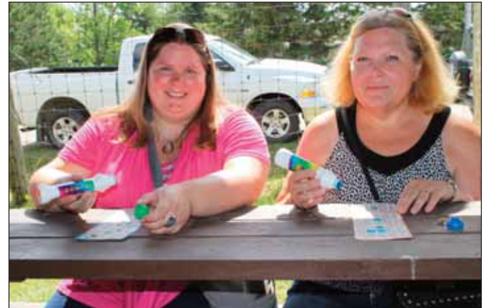
"Under the B..." - Proceeds from the dabber bingo at the fair is used to support local charities and organizations.