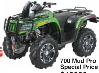
700 Mud Pro Special Price $10299