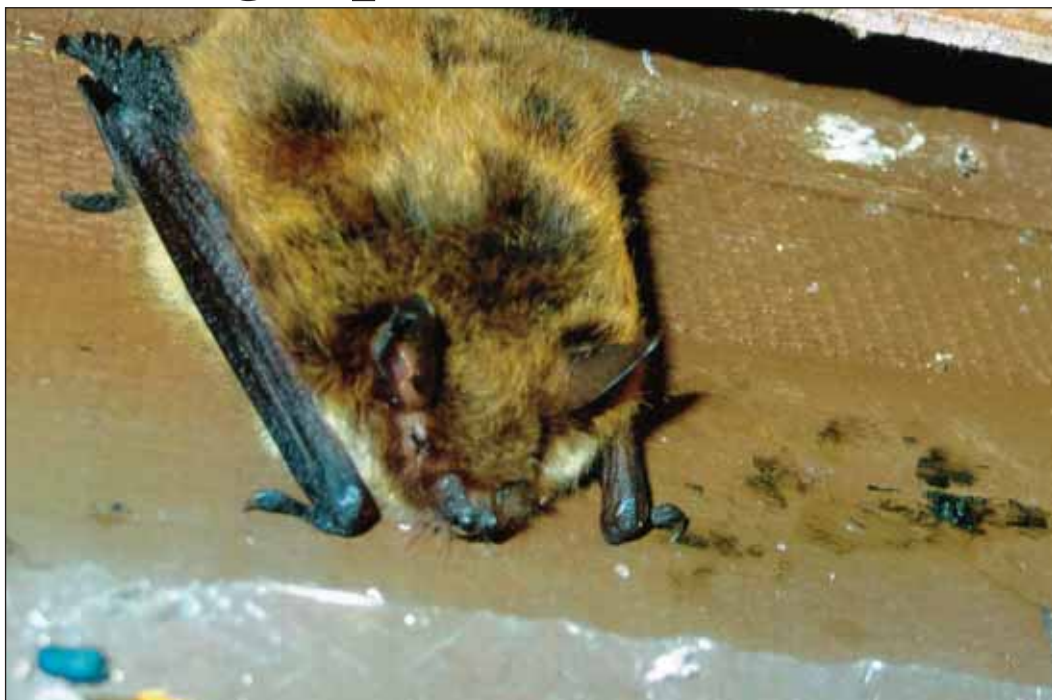
"It's been a long, long winter and this bat is looking around to see if it's safe to come out." Photo taken last spring.