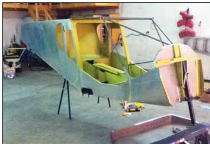
A work in progress – four years to complete from start to finish.

"It's been a long labour of love", he smiles proudly as he looks over at his new plane.