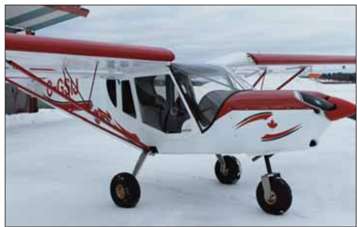
Ready for its maiden flight...any day now!

"Nestor Falls is a beautiful destination", notes MacDonald