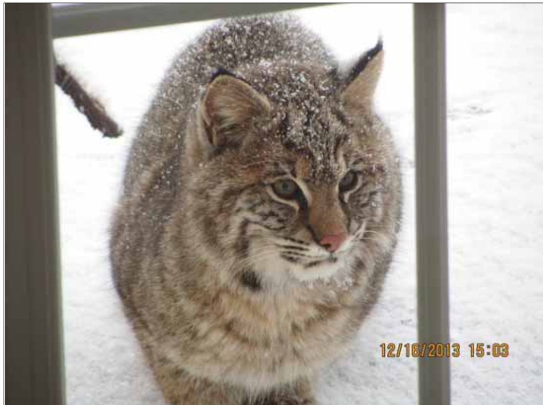
A bobcat on deck looking in through patio door. He/she spent most of the afternoon exploring around the yard and almost seemed tame.

near Gameland, ON