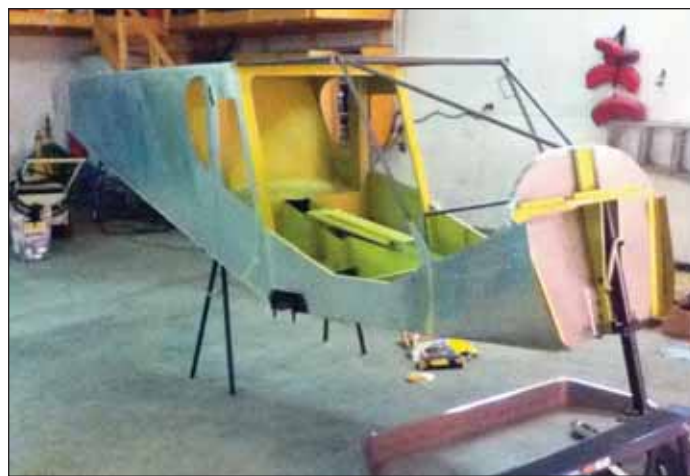
A work in progress – four years to complete from start to finish.

"It's been a long labour of love", he smiles proudly as he looks over at his new plane.