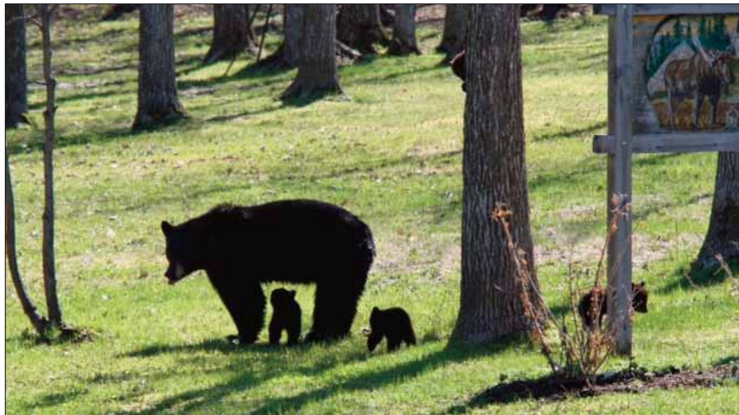
An unusual sight. Mama bear with four cubs. You can just see a little of the fourth cub up the tree peaking around from the other side. The photographer wanted to remain anonymous so that people wouldn't come looking for the bears.