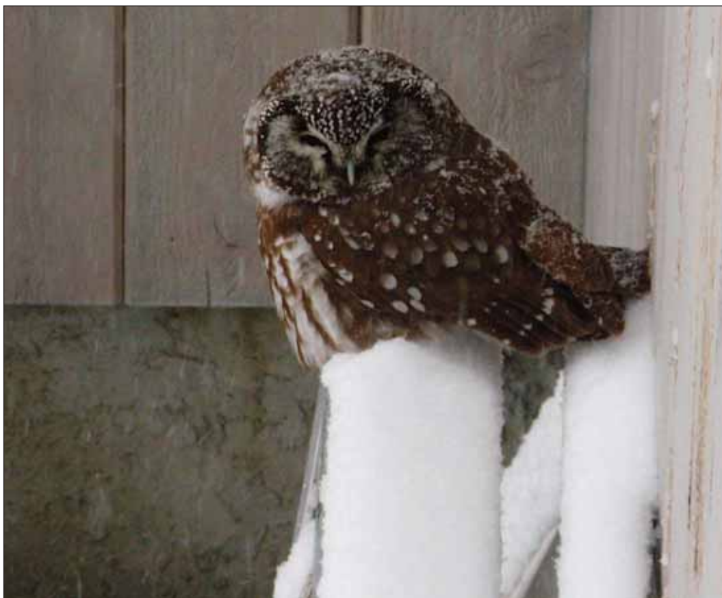
It was a stormy morning and the chickadees were making a fuss so I went outside to give them more sunflower seeds and discovered this little Boreal Owl hunkered down against the house near the bird feeders. He wasn't concerned with me and eventually perched on one of the feeders before flying off into the bush.