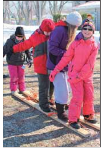
"Left. Right. Left. Right." This group of girls were working to get the hang of smooch boarding and having lots of fun doing it.