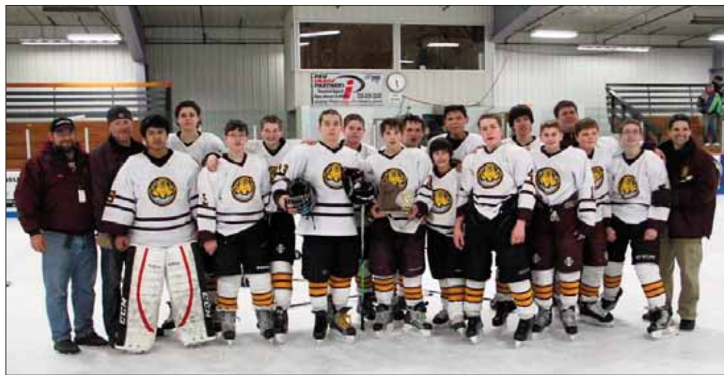
Representing Lake of the Woods School in Baudette, the Bears, Bantam team have finished their season in the number one spot in Minnesota District 16. Now they are on their way to play in the State finals.