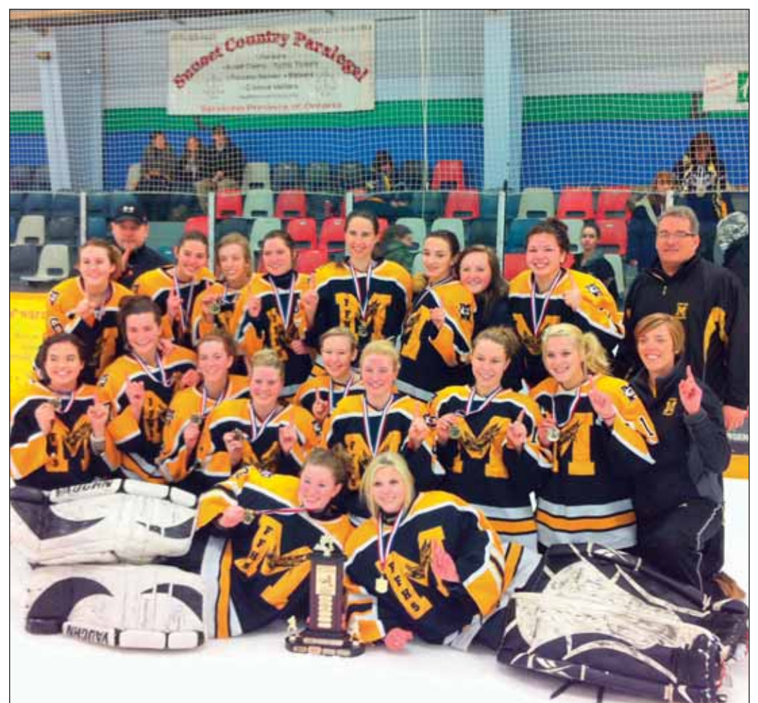
The Fort Frances High School Muskie Girls Hockey Team finished first in NorWossa with a perfect record of wins. They did not lose a game this year in regulation play or during the playoffs. They only needed two games to win the best of three series against the Dryden Eagles on the weekend to claim the NorWossa Championship. They will now carry this winning attitude to the All-Ontario's that are being held in Sudbury this year. Way to go Muskies!!!