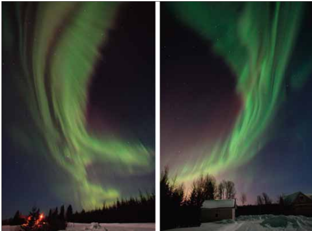
The Aurora Borealis were incredibly strong February 18th as they shone brightly despite an almost Full Moon trying to outshine its brilliance. Their reach was amazingly long as they dance amongst the Moon light. These pictures were captured around 2:30 AM at the front of our property on River Road.