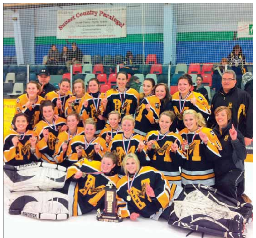
The Fort Frances High School Muskies Girls Hockey Team finished first in NorWossa with a perfect record of wins. They did not lose a game this year in regulation play or during the playoffs. They only needed two games to win the best of three series against the Dryden Eagles on the weekend to claim the NorWossa Championship. They will now carry this winning attitude to the All-Ontario's that are being held in Sudbury this year. Way to go Muskies!!!