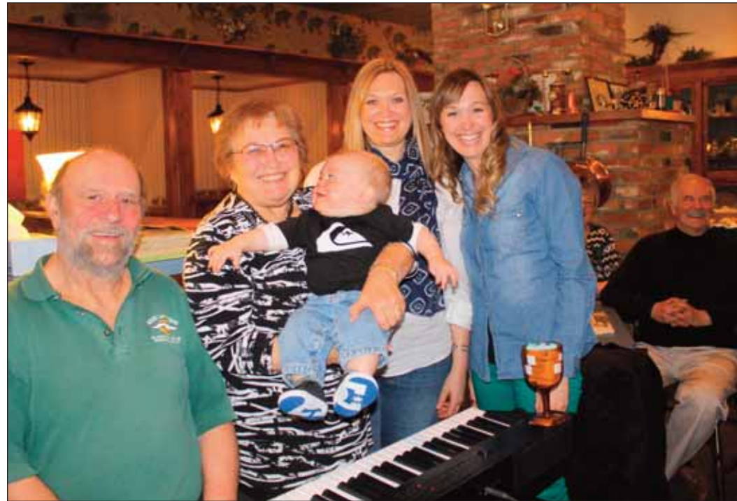
Three generations of mothers came out for brunch at La Flambee on Sunday afternoon. They were treated to a delicious assortment of food and