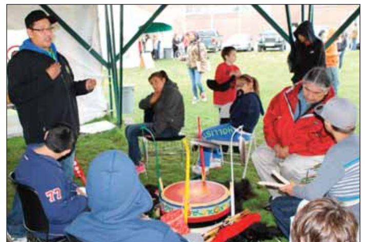
Traditional drumming is used for healing and learning.