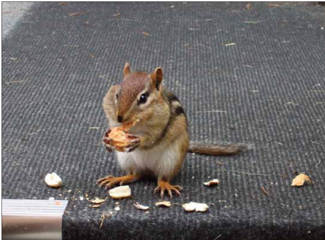
Here's a picture of Chippy, he comes to the front door for his daily peanuts. My husband befriended him after the passing of our cat Buffy.