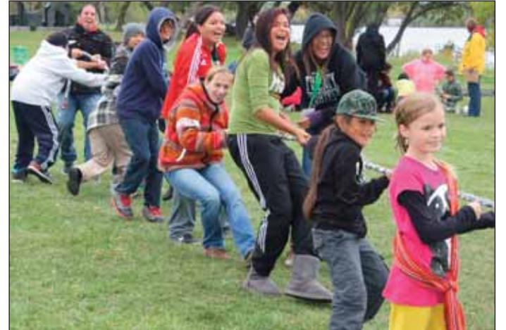
Teamwork and fun!