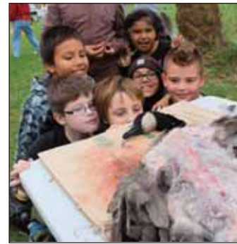
Children checked out the goose being plucked to make goose soup.