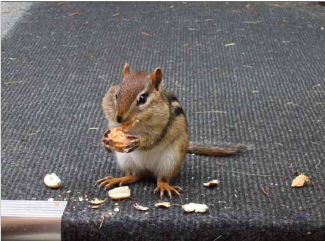
Here's a picture of Chippy, he comes to the front door for his daily peanuts. My husband befriended him after the passing of our cat Buffy.