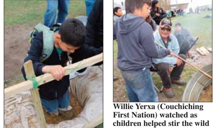
Dancing on Wild Rice!