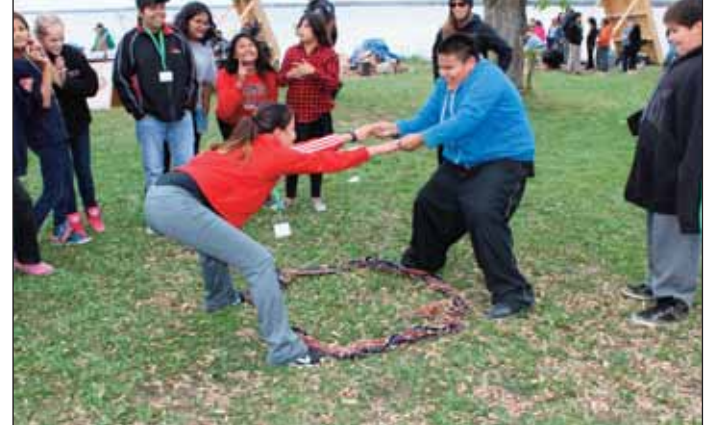
Balance and strength training at the Metis Voyageur Games.