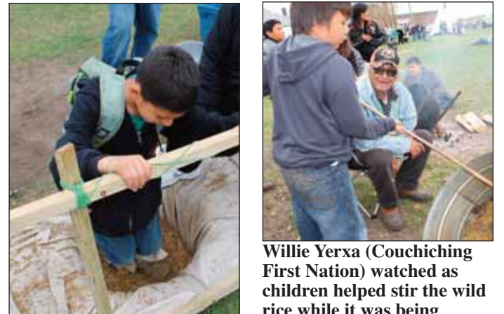
Dancing on Wild Rice!