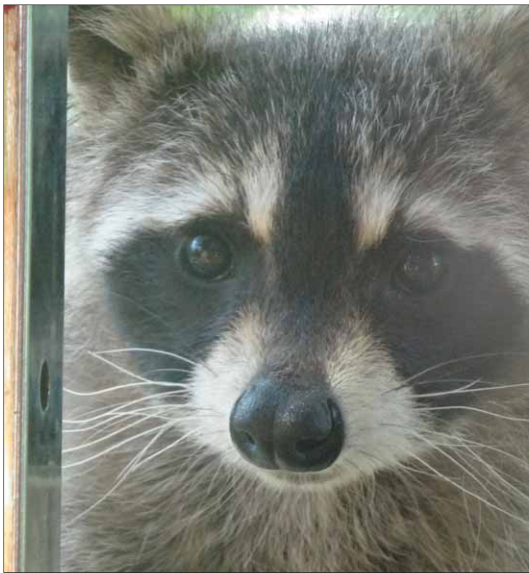
All alone, in broad daylight, this young raccoon climbed up to our upper deck and was looking through the window at me! The raccoons sometimes visit after dark but not this brave little character who was a cute as can be! Taken in Sioux Narrows June 16/14.